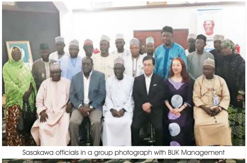
Sasakawa officials in a group photograph with BUK Management