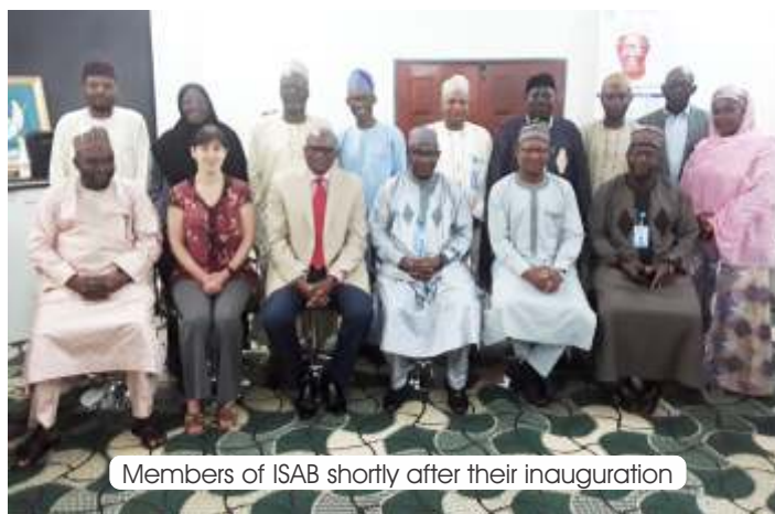
Members of ISAB shortly after their inauguration