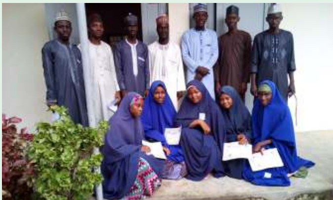
Winners of the competition in a group photograph with their teachers

Certificates and awards were presented to participants and winners respectively.