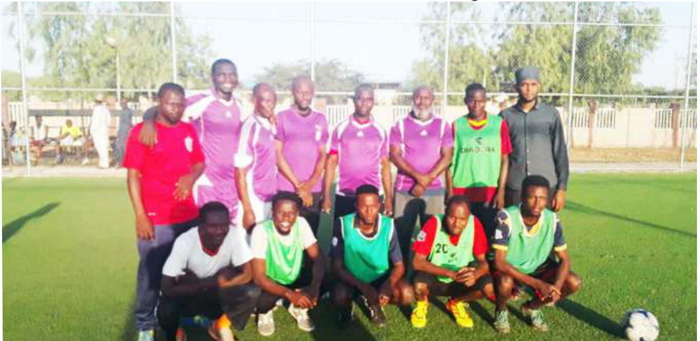
Staff of the Department of Electrical Engineering and their students in a group photograph