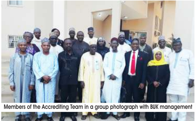
Members of the Accrediting Team in a group photograph with BUK management

“We pay much attention to quality assurance mechanism in the University, that's why we empower the committee of quality assurance to make sure that quality remains our