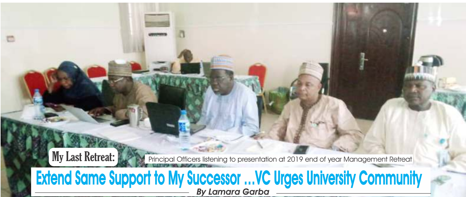
My Last Retreat: