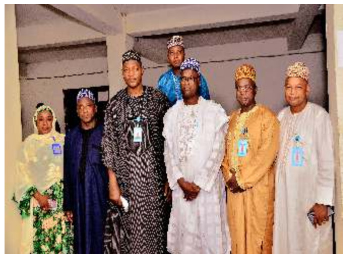
BUK management with the Director SSS and other Senior officers