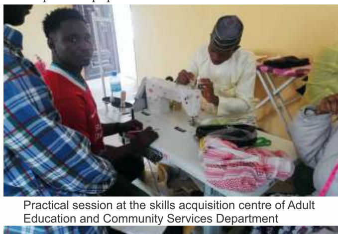
Practical session at the skills acquisition centre of Adult Education and Community Services Department

The Department of Adult Education and Community Services on Monday, 10 th January, 2022 launched additional literacy acquisition and entrepreneurship development equipment.