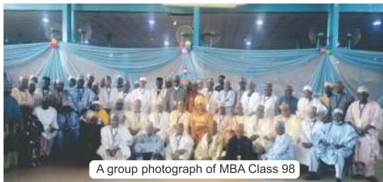
A group photograph of MBA Class 98