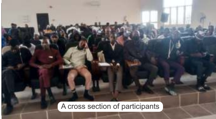
A cross section of participants

The Department of Islamic Law, Bayero University in collaboration with Maslaha Chamber organized a one day symposium for its students on the rightful way of living in accordance with the teachings of Islam.