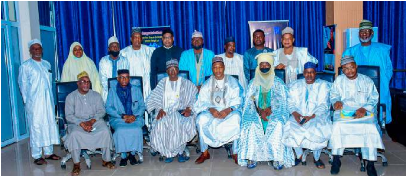
A group photograph of Principal officers and members of BUK Alumni Caretaker Committee

The Bayero University, Kano Alumni caretaker and electoral committee has drafted an action plan that will guide and help in conducting a free, fair and credible election for new members proposed to come up on Friday 10 th and Saturday 11 th June, 2022.