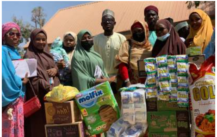
Level 400 students of Department of Adult Education and Community Development posing with the donated items

disadvantaged, and proffer workable solutions to their life conditions for proper mainstreaming, development and survival of humanity."