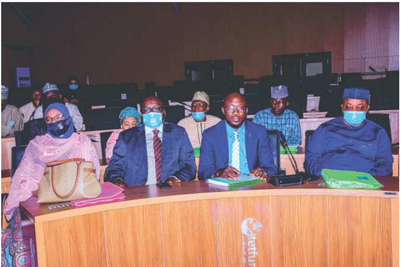
A cross section of NUC Accreditation Teams at the Senate Chamber