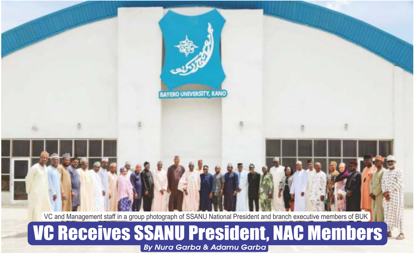
VC and Management staff in a group photograph of SSANU National President and branch executive members of BUK