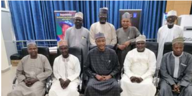
Members Board of Directors and PTA of Darul Uloom Islamiyya School in a group photograph with VC and other Principal officers