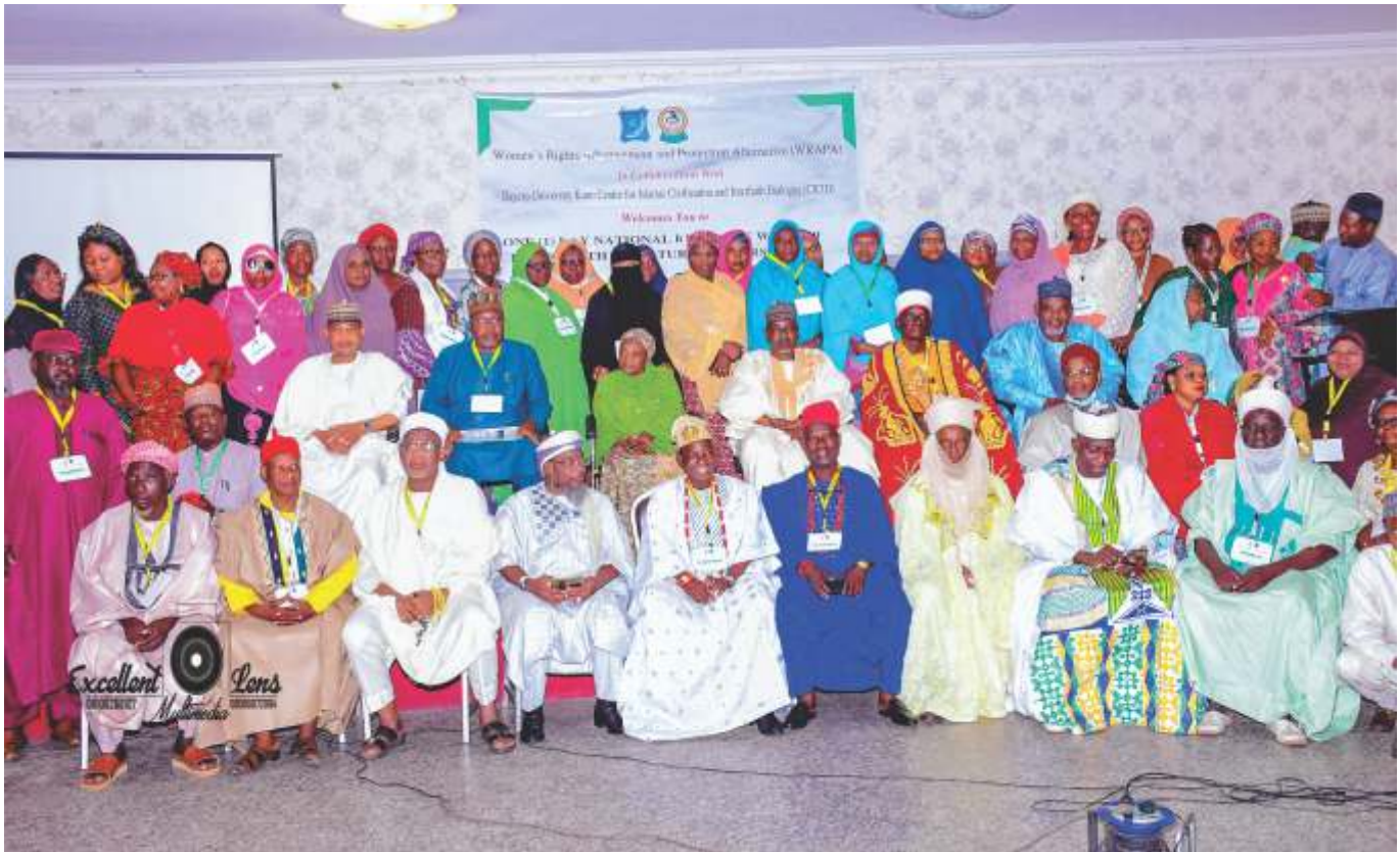
Participants at the one-day National Dialogue with 100 Faith and Culture Leaders (F&C) organised by BUK-CICID and WRAPA