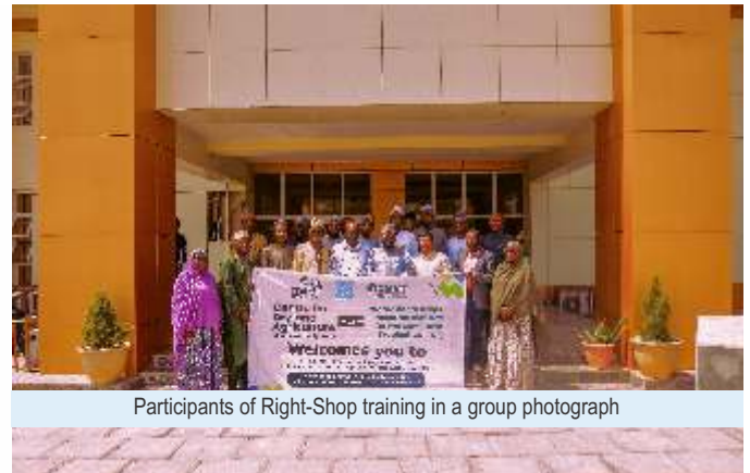
Participants of Right-Shop training in a group photograph

Commission recently and emphasized on the importance of collaboration between the two parties in the area of capacity building, promotion of research and innovation, as well as grants management.