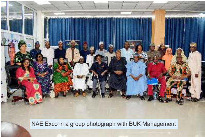
NAE Exco in a group photograph with BUK Management

NAE as one of the professional bodies in the sector to play a vital role at the national level and design the school curriculum, which he said would go a long way in educational development in Nigeria.