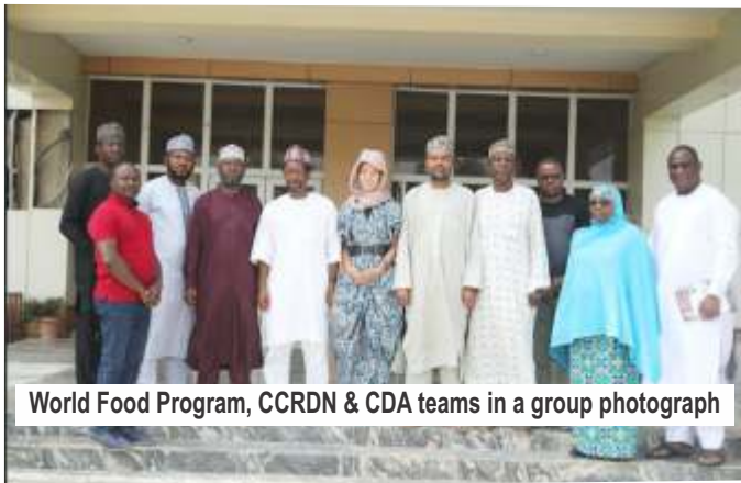
World Food Program, CCRDN & CDA teams in a group photograph

CCDRN and the United Nation's World Food Programme (WFP) have been in collaboration to create employment and improve the income of 60,000 youth and women along the food system value chains in Yobe and Jigawa states through a project called " Strengthening Food Systems to