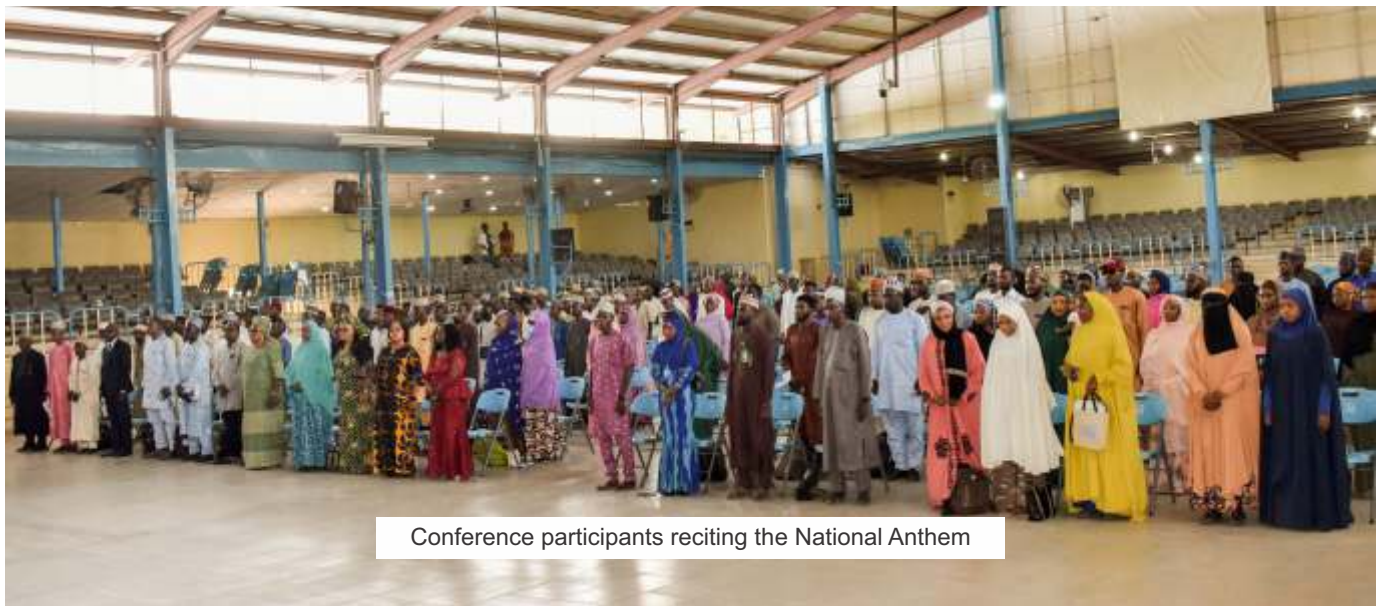
Conference participants reciting the National Anthem

She expressed optimism that at the end of the conference scholars would come up with collection of ideas for a better funding system of tertiary institutions in Nigeria.