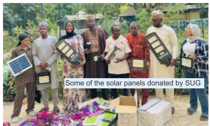
Some of the solar panels donated by SUG