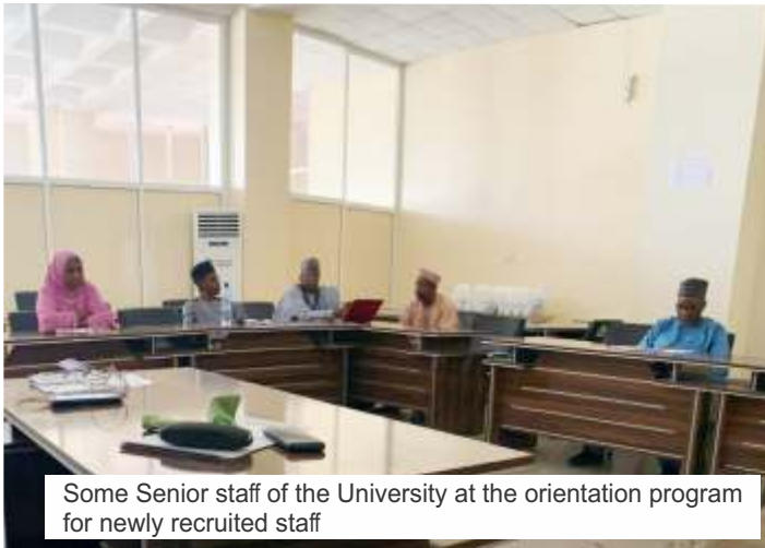
Some Senior staff of the University at the orientation program for newly recruited staff