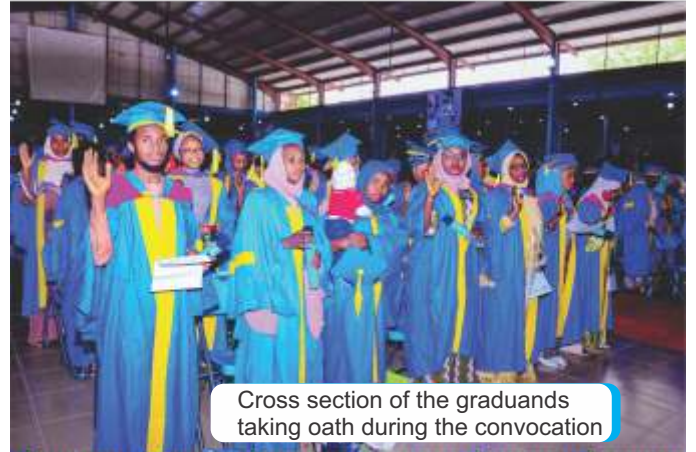
Cross section of the graduands taking oath during the convocation

He said as part of the management's effort to reach out to corporate organizations and individuals for intervention in various aspects of technological and infrastructural development, the Bank of Industry readily accepted to establish a Technology Hub for skills acquisition in BUK with the aim of promoting entrepreneurship amongst the youth.