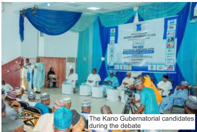
The Kano Gubernatorial candidates during the debate