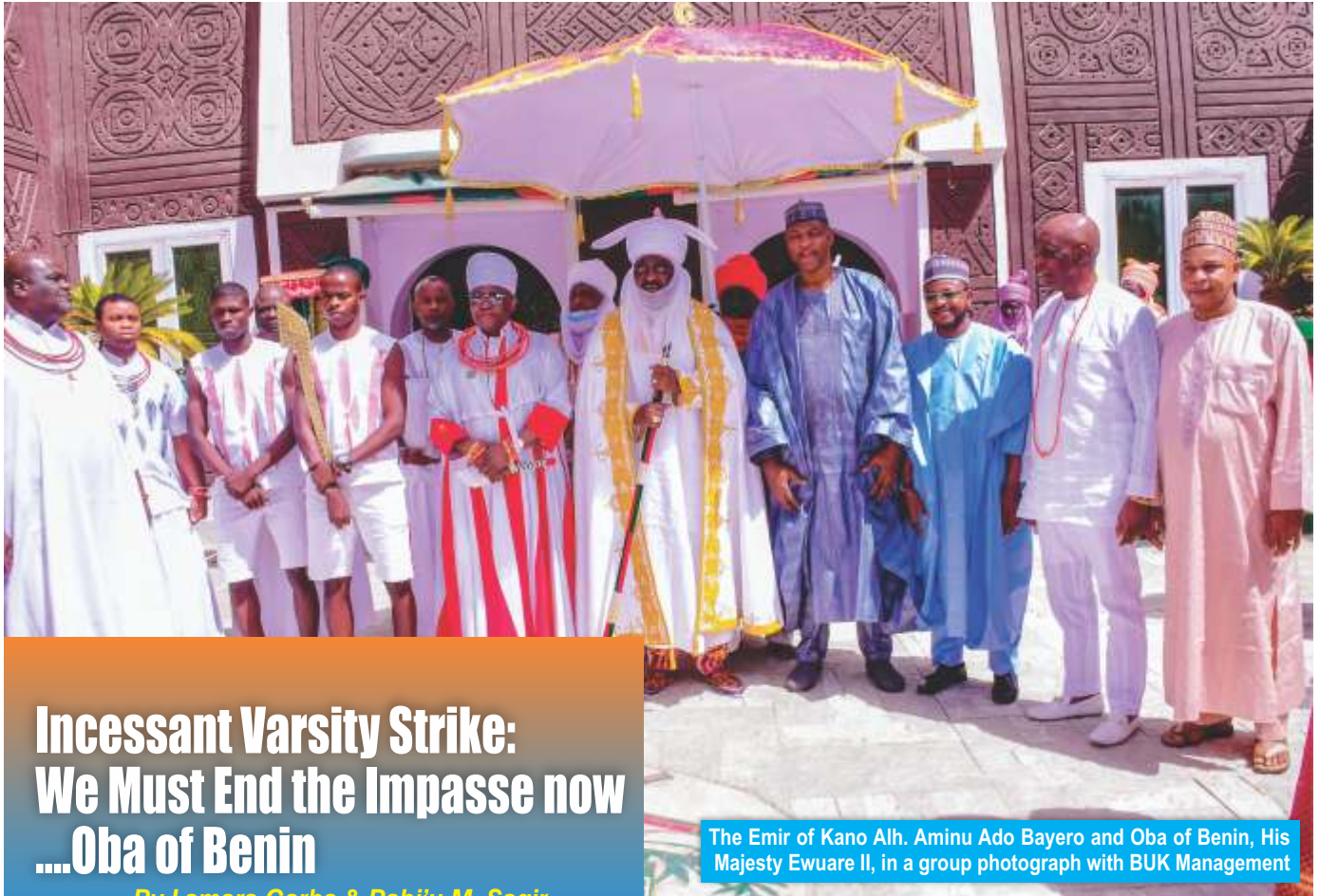
The Emir of Kano Alh. Aminu Ado Bayero and Oba of Benin, His Majesty Ewuare II, in a group photograph with BUK Management