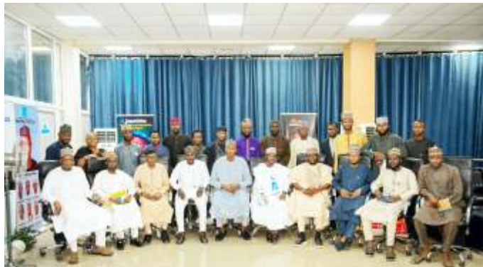
NAKSS Exco in a group photograph with BUK Management