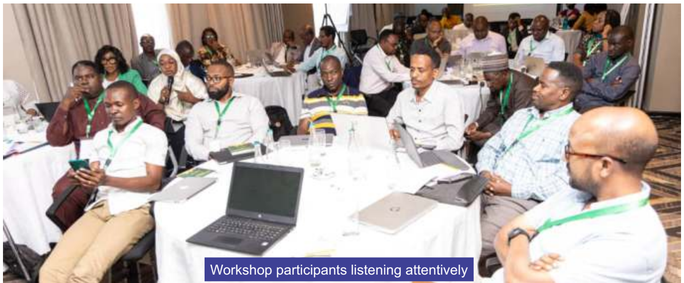
Workshop participants listening attentively