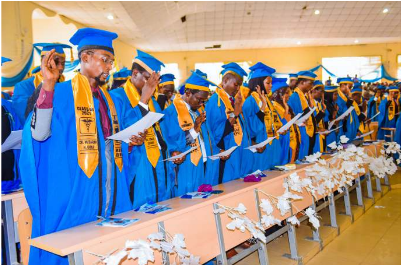
Cross section of inductees taking oath of allegiance

The Bayero University, Kano has inducted 87 newly qualified Medical Doctors and 16 Dentists from the Faculties of Clinical Sciences and Dentistry of the College of Health Sciences (CHS).