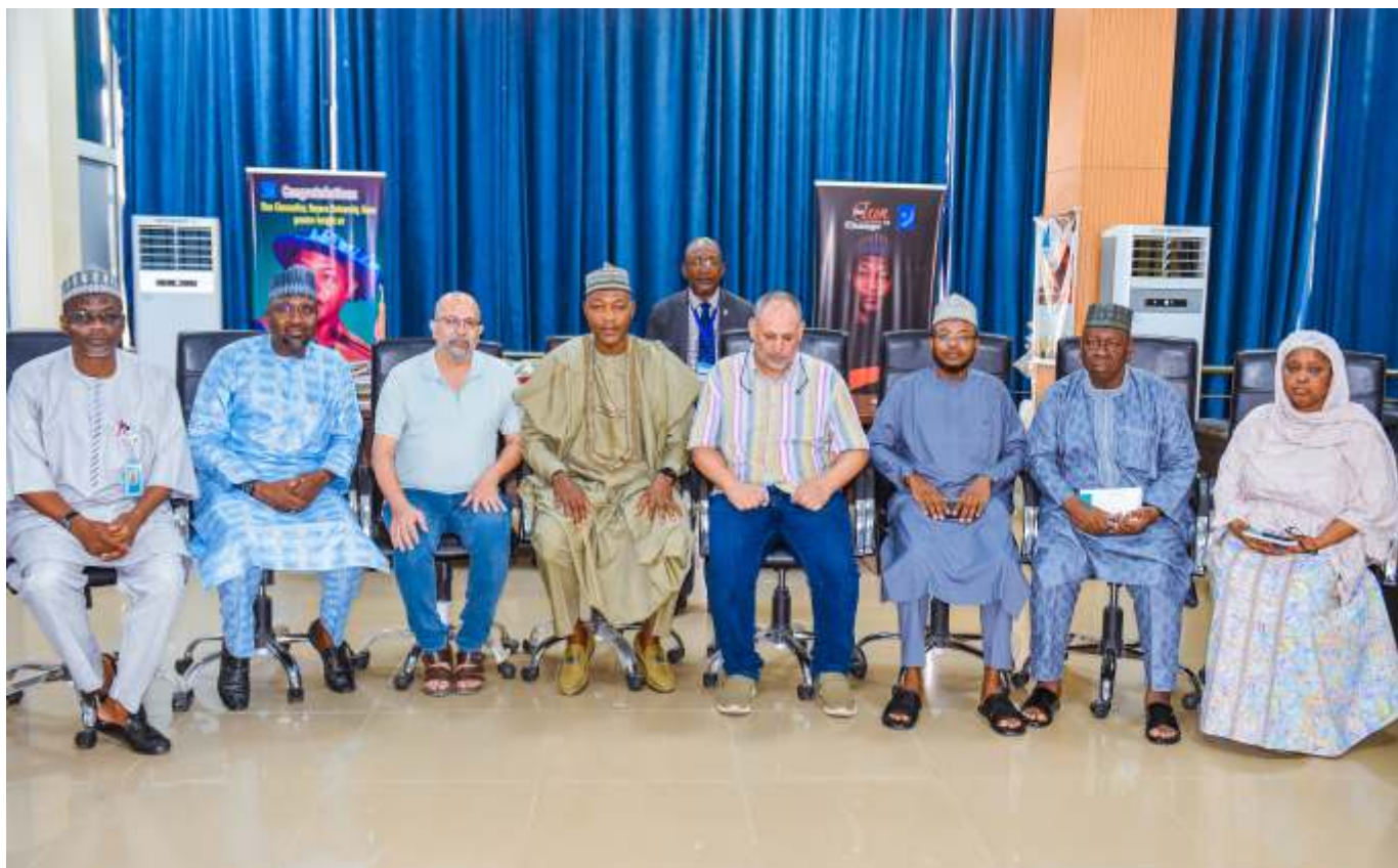
A group photograph of members of University Management and officials of Qatar Charity Foundation