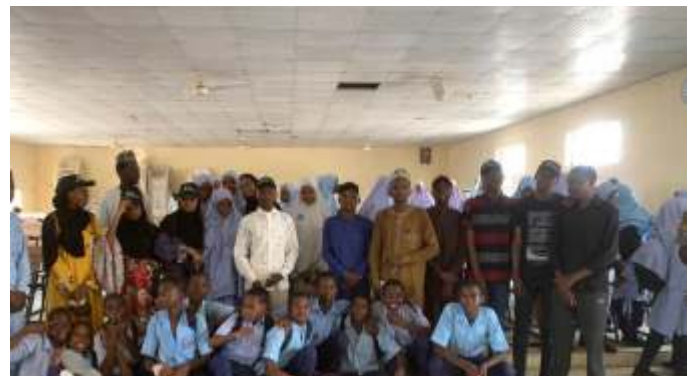
A group photograph of members of Agricultural Ambassadors and some students of BUK Staff Secondary School

Agricultural Ambassadors BUK is open for partnership and collaboration for the next phases of the project. We can be reached via any of our social media handles.