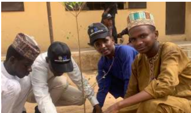
Tree planting activity of the Agricultural Ambassadors

It is one of the Reforestation projects around the world, which Climate enthusiasts are working tirelessly to restore areas that have been affected by deforestation.