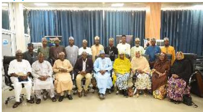
Nursing and Midwifery team in a group photograph with BUK Management