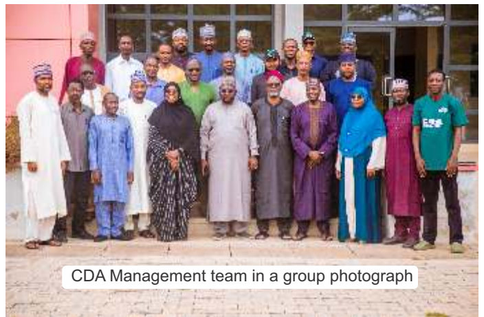
CDA Management team in a group photograph