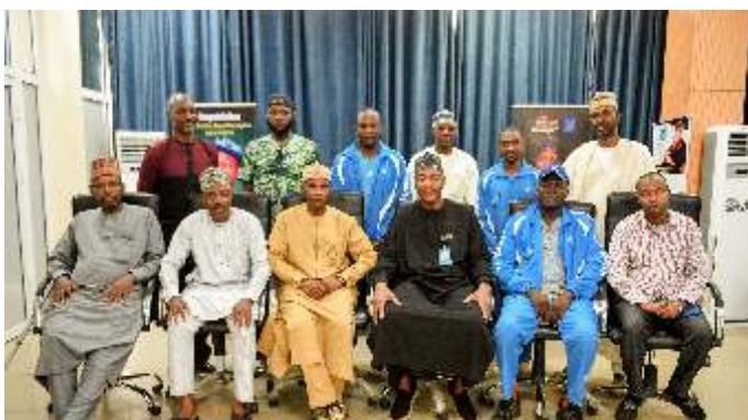
A group photograph of BUK Management and BUK's Tennis Association