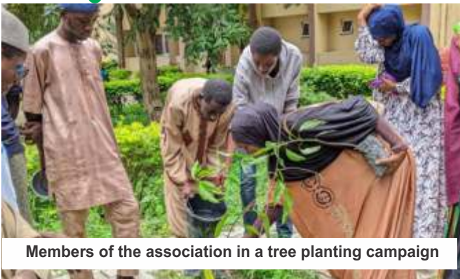
Members of the association in a tree planting campaign