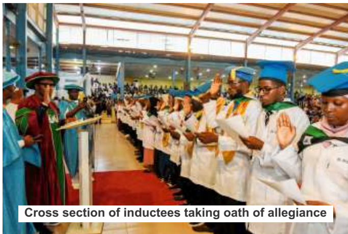
Cross section of inductees taking oath of allegiance

The remarkable ceremony saw 48 graduands of Doctor of Optometry, 73 graduands of Bachelor of Medical Laboratory Science, 42 graduands of Bachelor of Radiography, 112 Bachelors of Nursing Sciences and 62 Bachelors of Physiotherapy being inducted by the University.