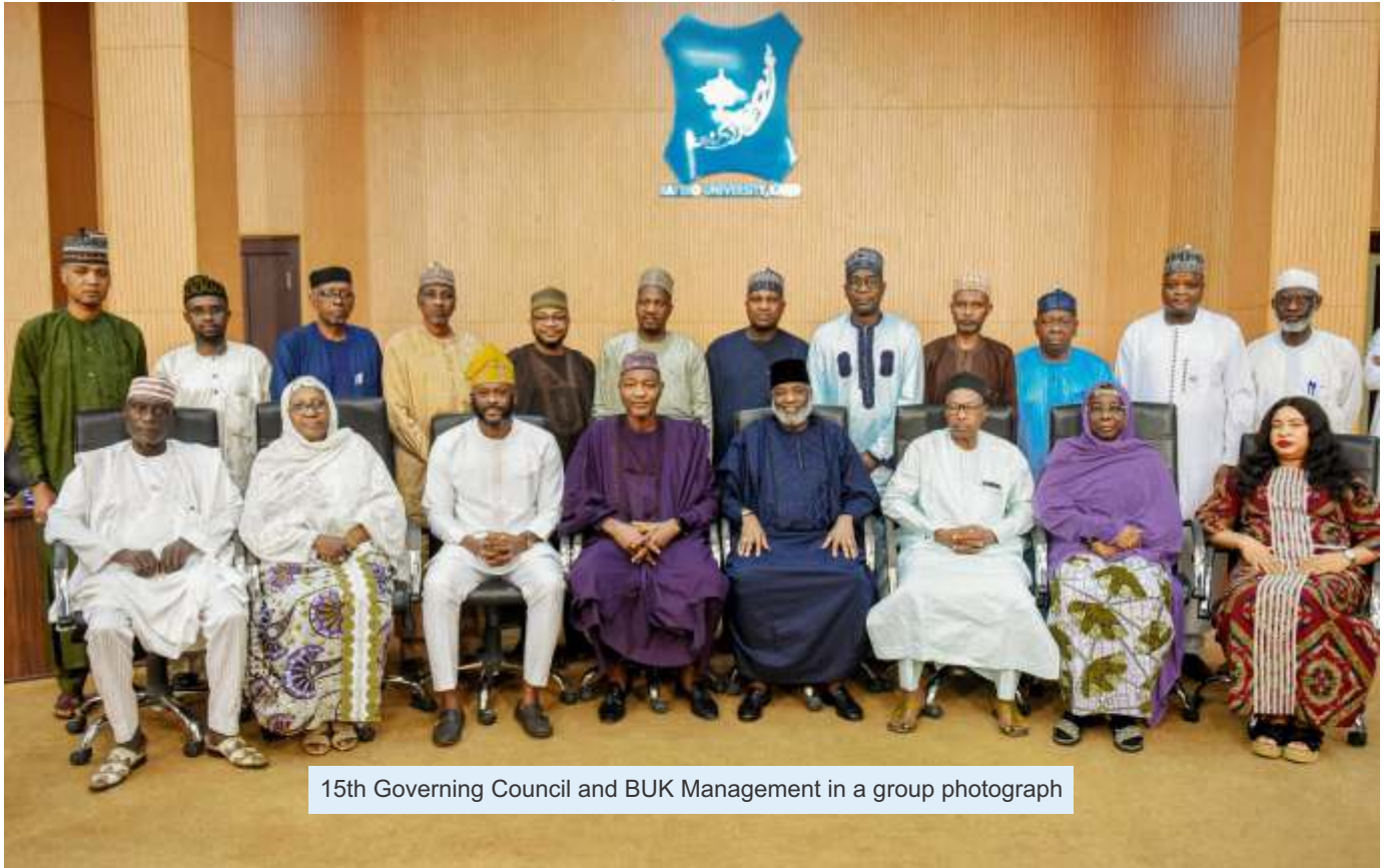
15th Governing Council and BUK Management in a group photograph

The members of the 15 th Governing Council of Bayero University held their maiden meeting from Monday, 19 th to Friday, 23 rd August, 2024. The meeting, which took place at the Council Chamber in the Abubakar Rasheed Senate Building, had in attendance all the external and internal members.