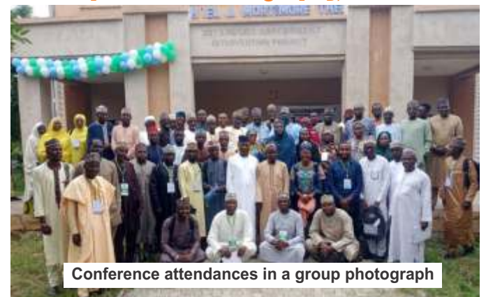
Conference attendances in a group photograph

Awards for the overall best graduating students in pre-clinical and clinical were also presented by various professional bodies.