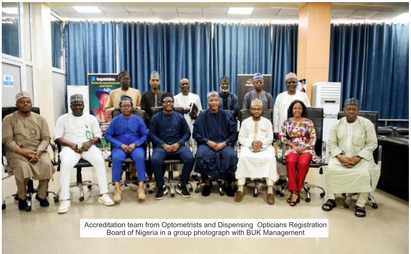
Accreditation team from Optometrists and Dispensing Opticians Registration Board of Nigeria in a group photograph with BUK Management

He equally commended the department for what he described as wonderful performance of all the students they interacted with. “The students exhibited good knowledge and were excellent in modern techniques, which is a good development and commendable.”