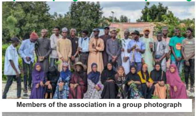
Members of the association in a group photograph

Agricultural Ambassadors in line with one of its objectives of contributing to a sustainable and green world had in collaboration with the Office of the SUG Governor AKTH Campus, Youth Day of Service (YDOS) and LEAP Africa carried out its Fourth Phase of its tree-planting drive with the theme Eco Pulse: Branching out for Health on Saturday in commemoration with the International Youth Service Day. This time at the AKTH Campus of BUK which 40 fruiting seedlings were planted (cashew, Mango & Malmo). You can recall that Agricultural Ambassadors embarked on this drive in mid-May of this year with its first phase at Staff Secondary School BUK, the second at the Tudun Yola Community in Gwale Local Government and the third in its home base at the Faculty of Agriculture. The Organization has already prepared for the next phase of this tree planting drive which it will be carried out at the New School of Postgraduate, Danbare Community and Old site Campus the soonest.