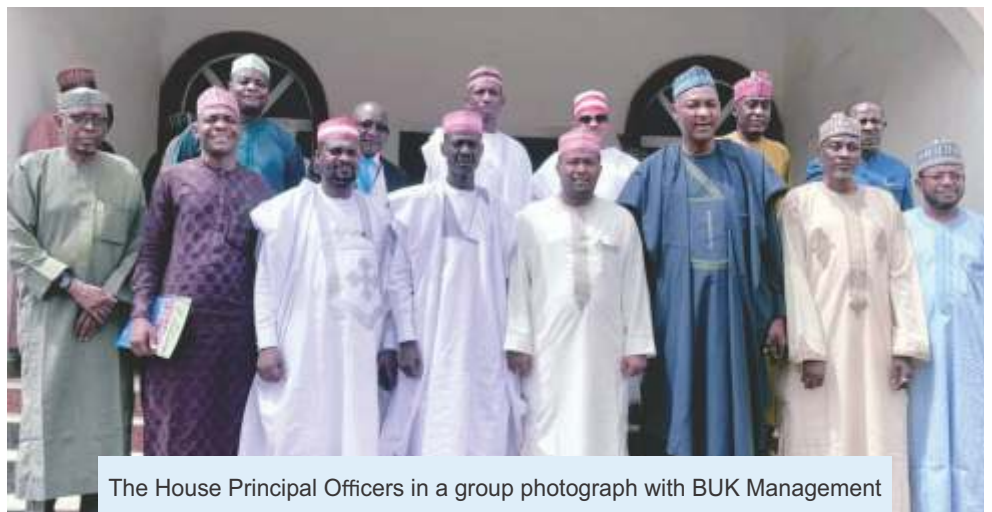
The House Principal Officers in a group photograph with BUK Management