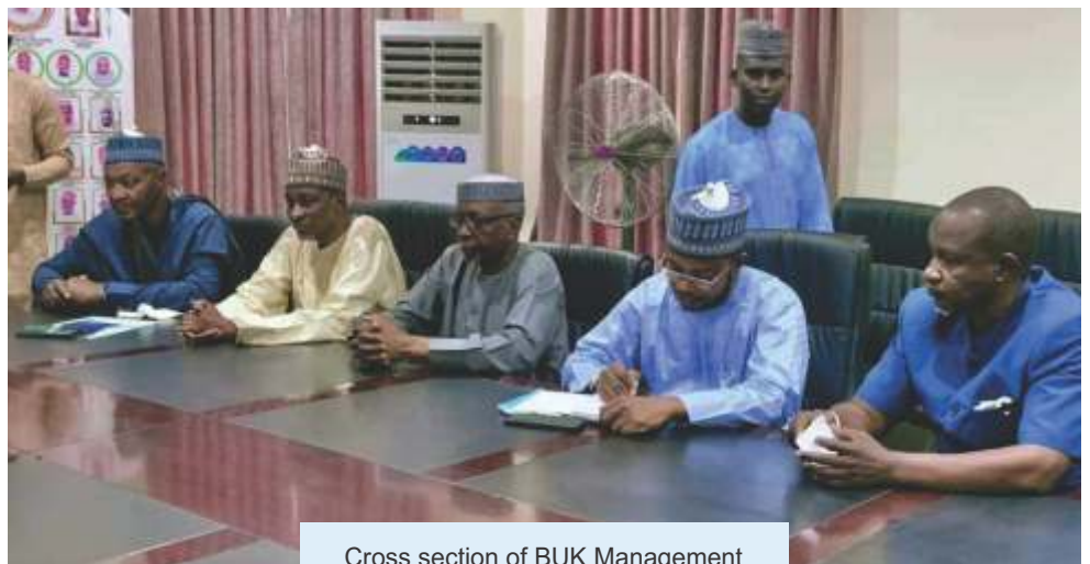
Cross section of BUK Management