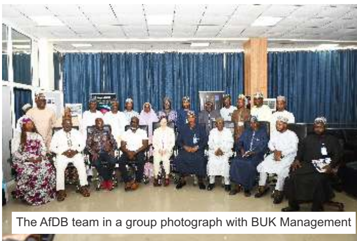
The AfDB team in a group photograph with BUK Management