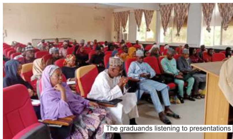
The graduands listening to presentations

He expressed his happiness that BUK was one of the two Universities chosen to do the training which he said was made possible as a result of the supports from the University Management as well as the staff of the faculty.