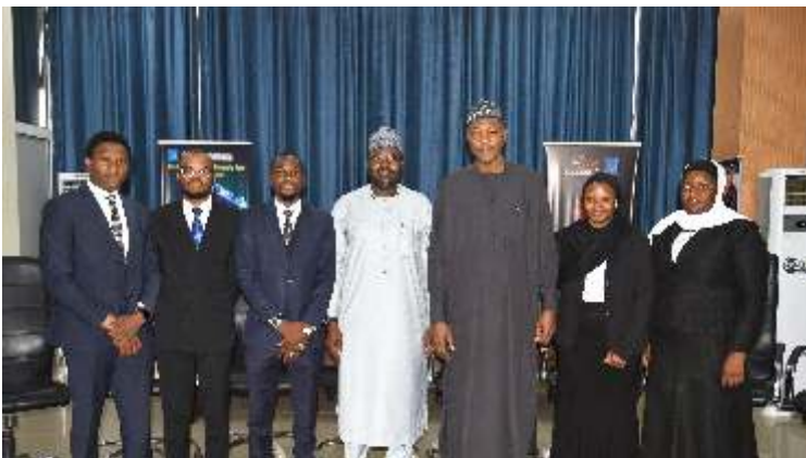
The VC in a group photograph with the Victorious Law Students