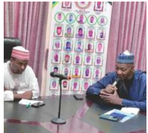
Vice Chancellor presenting his address