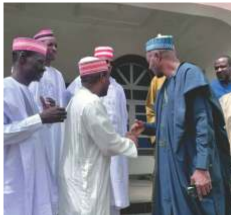
The VC being received by the Speaker

"It may interest you to know that because of the