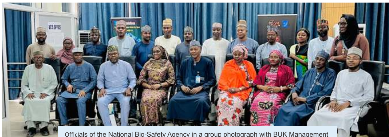
Officials of the National Bio-Safety Agency in a group photograph with BUK Management

In seeking collaboration with Bayero University, she proposed joint bio-safety and biosecurity-related projects to promote best practices in bio-safety across various