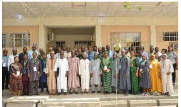
TETFund Kidney Transplant training participants in a group photograph

The Vice-Chancellor appreciated the effort of TETFund intervention in funding the project and for supplying the equipment to the Universities Teaching Hospitals. He said teaching hospitals often served as laboratories to most of the researches conducted in College of Health Sciences