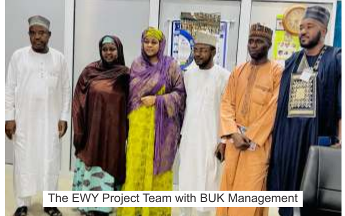
The EWY Project Team with BUK Management