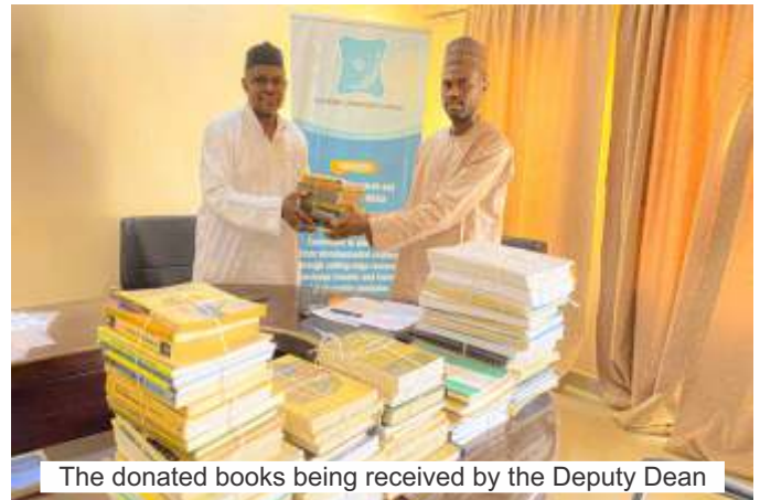
The donated books being received by the Deputy Dean