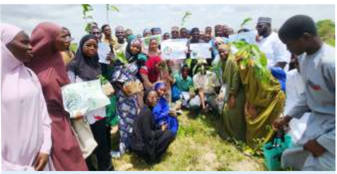
Members of NAAS, IAAS and FOWSAN in a group photograph during the campaign

During the event, several trees were planted, including species carefully selected for their suitability to the local environment. Students and faculty members worked side by side, planting and watering the trees, fostering a sense of community and shared responsibility.