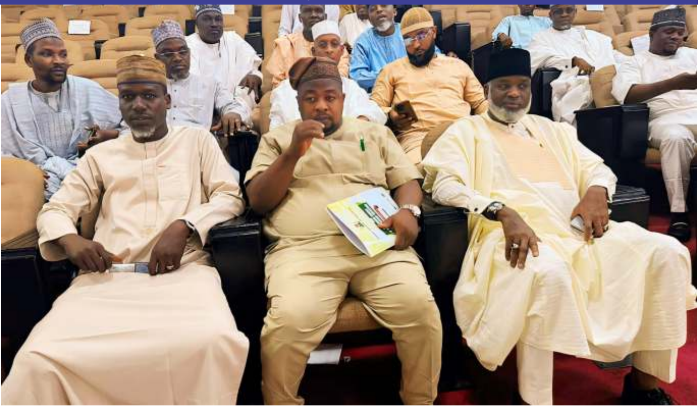
HE Nasiru Yusuf Gawuna, sitting 1st right during the inauguration of the Council members

inaugurated the Governing Councils of federal tertiary institutions with a stern warning against undue interference in the day -to-day management of the institutions on Thursday, 4th July, 2024.